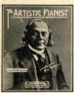
VLADIMIR DE PACHMANN