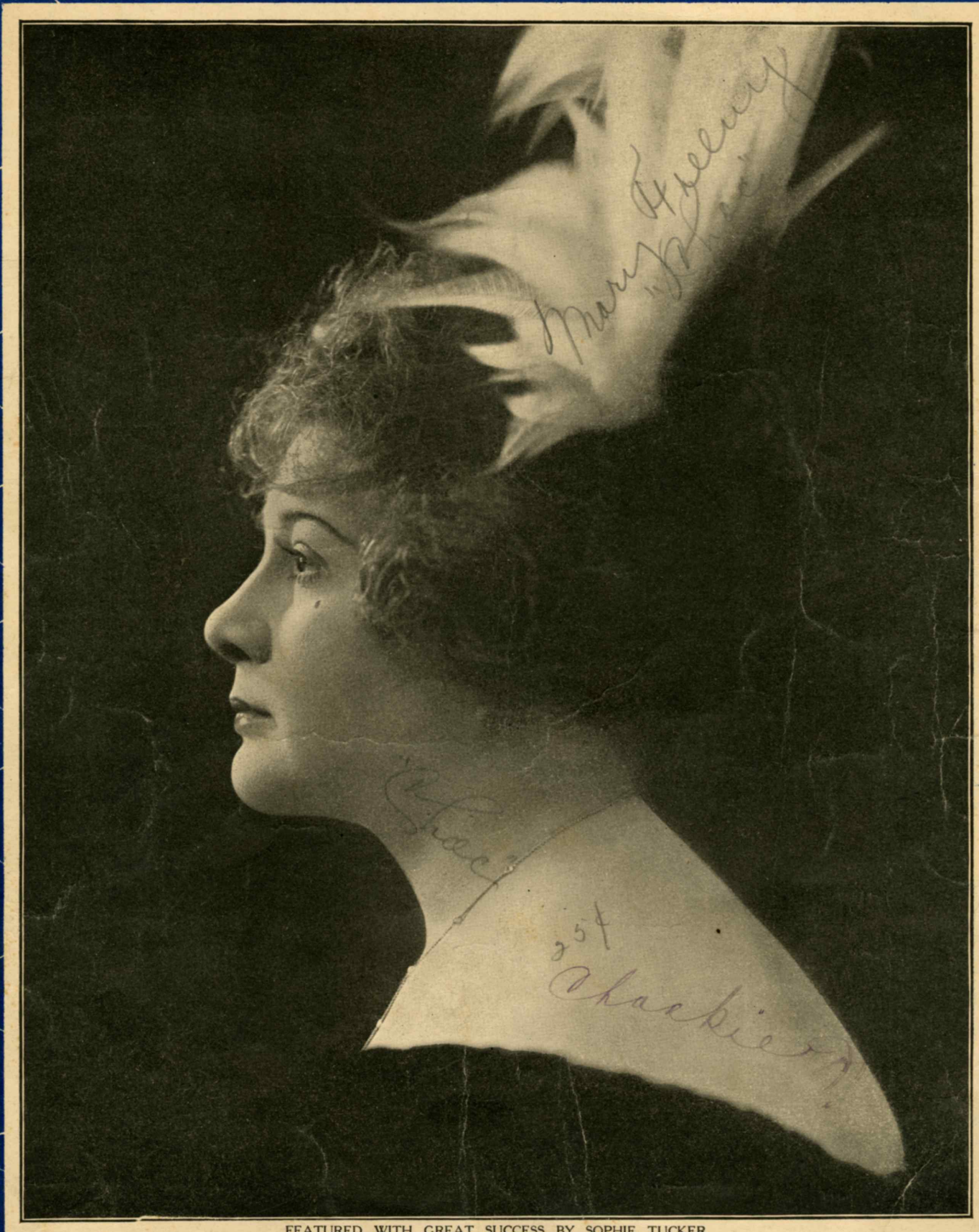
FEATURED WITH GREAT SUCCESS BY SOPHIE TUCKER